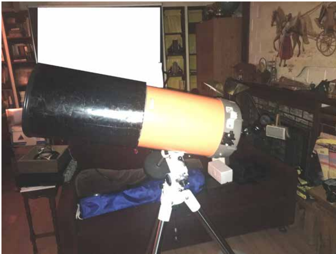
The black dew cap mounted on the front end of the orange C8 telescope. The 5 resistors are attached inside the dew cap, where the dew cap and telescope meet.

to clear the lenses. In general, that means fairly large, portable batteries, or a connection to your vehicle, or gasoline-driven generators. These requirements made me try another