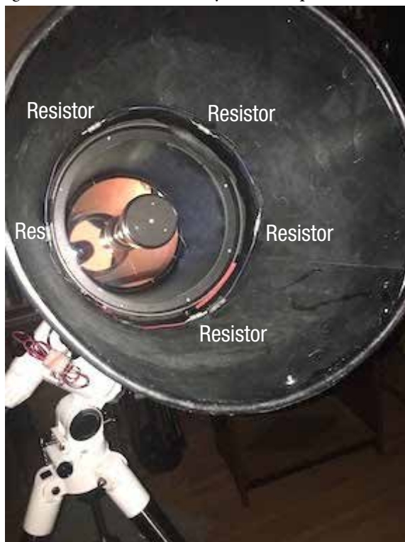
Note the 5 resistors deep in the C-8 dew cap, just in front of the C-8 telescope. They are connected as a series circuit. You can see the wire which connects one to the next. The 2 wires for connecting the resistors to the external voltage source are a small bundle at the lower left, on top of the tripod telescope mount