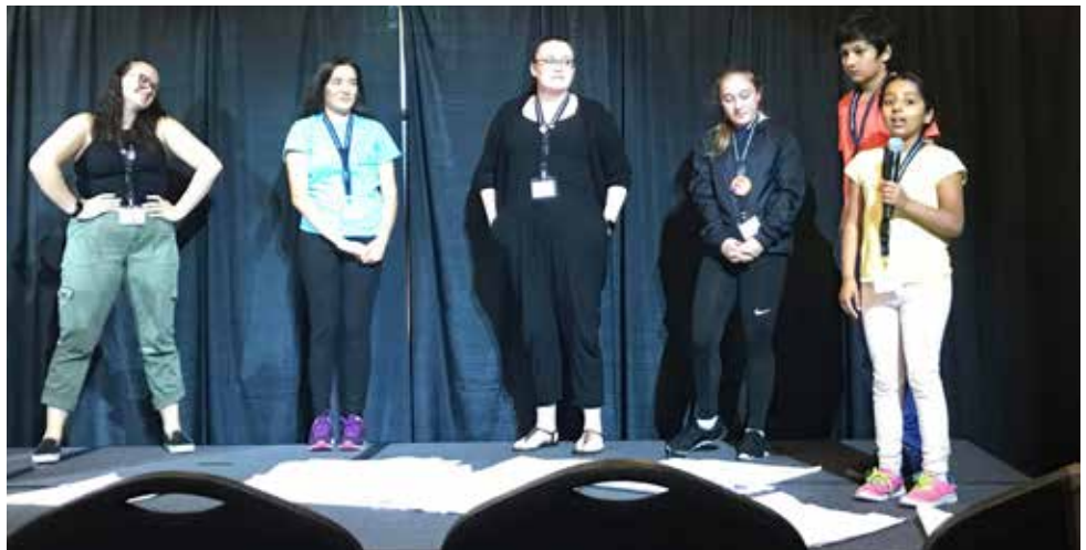
Below: Youth Committee members leading the Youth in the RASC workshop