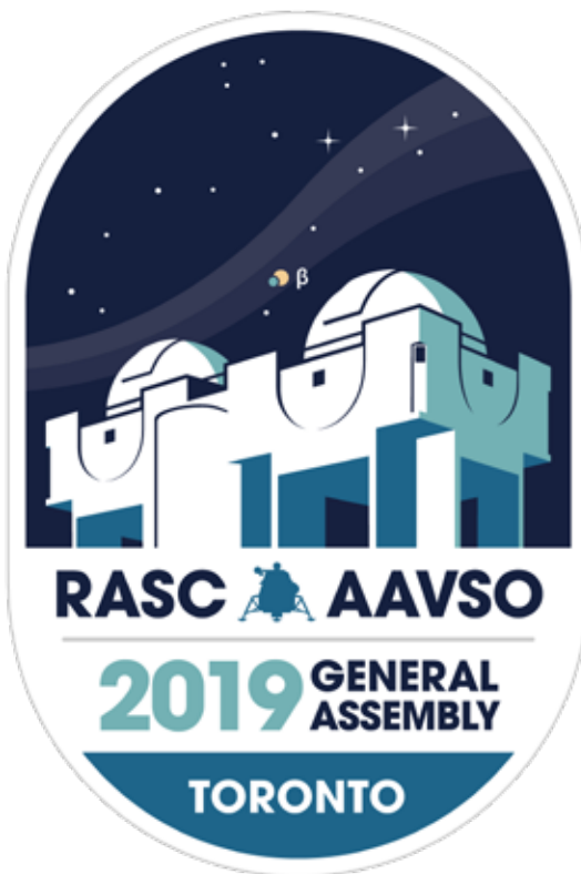
table with swag to purchase! I received a beautiful bag, pin, and stickers and bought a T-shirt and a pop-up for my phone.

The beautiful GA logo design is the twin observatories of York University and seen above the domes is Beta Persei (Algol), The Demon Star—an eclips-