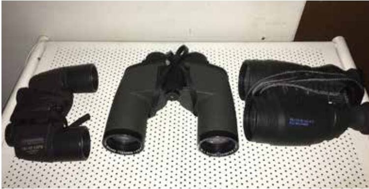
Fig. 1: A selection of binocular types, sizes and powers

objects I want to look at. I am talking here about finding them “manually,” not using computerized telescopes. In many cases, people already own some binocu-