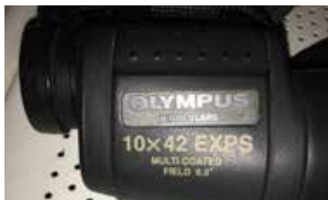
Fig. 2: 10 power and 42mm dia.

(in millimetres [mm]) are displayed somewhere on each pair of binoculars in the form of POWER × DIAMETER (i.e. 15×50 for the Canon binoculars). In addition, the field of view in degrees is also shown.