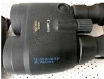
Fig. 3 & 4: The Bushnell (top) and stabilized Canon (bottom) binoculars each have 50mm front lenses