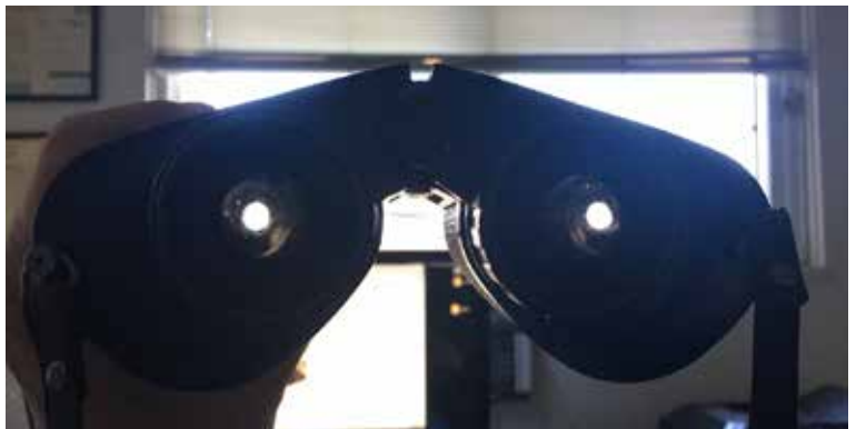
Fig. 5: Exit pupils seen through the eyepieces